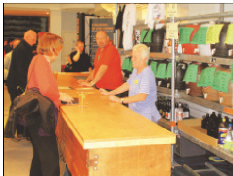
Real cider and perry are always popular

Although it is too early to name the beers and ciders as we go to press, the final list will be posted on www.northbedscamra.org.uk as soon as the final order is confirmed in September. Details will also be printed in the free souvenir