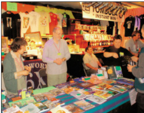
East Beds CAMRA members run the shop

The hall lift will be available for those with baby buggies or using wheelchairs. Visitors with restricted mobility should ask festival staff at the door to arrange lift access direct from a side door at street level.