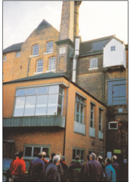
Hardys & Hansons Kimberley Brewery on a CAMRA branch visit in 2001

"Greene King is a major brewer and promoter of real ale, but it has to listen to real ale drinkers, reverse its decision, invest in the Hardys & Hansons brewery and promote genuine Hardys & Hansons beers for the future."