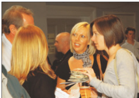
A great place to party!

Helpers included a number of hard-working volunteers from outside the area, as well as local member and friends. East Bedfordshire CAMRA members ran the shop and tombola, while the entire team of stewards greeting visitors at the door came up from Luton every day. Other helpers came from even further afield.