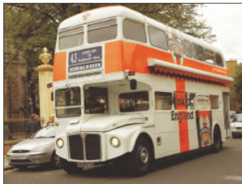
Wells' Bombardier Bus toured the town centre

Although customers come to beer festivals expecting a decent choice, it is risky for organisers to order too much as unsold beer can make all the difference between profit and loss on the event. Half-empty casks of live beer cannot be returned or used elsewhere, and unlike a pub running its own festival, cannot be sold the following week.