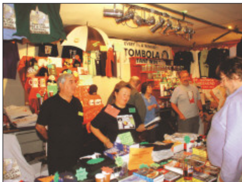
East Beds CAMRA members ran the shop

"Organising this festival requires months of planning and enough CAMRA volunteers and friends willing to give their time free to work behind the bars, glasses and other functions. We couldn't run the festival without volunteers."