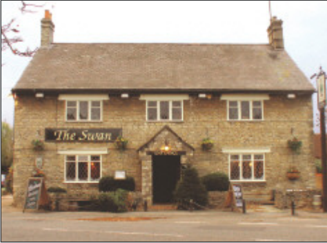
New team at the Swan, Bromham