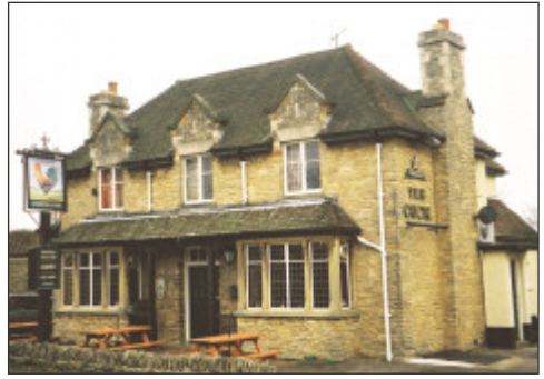
Change of hands at the Cock, Pavenham

Welcome to new landlord Brendan, who took over this friendly village pub in October. Brendan previously ran the Blacksmiths Arms, Ravensden. The food menu offers traditional, home-cooked dishes, including steaks, pies, daily specials and a choice of roasts on Sunday. Greene King IPA, Abbot and a weekly guest beer are available on handpump. The bar now opens all day every day from 12 noon. As dining space is limited, it is advisable to book your table beforehand on 01234 822834.