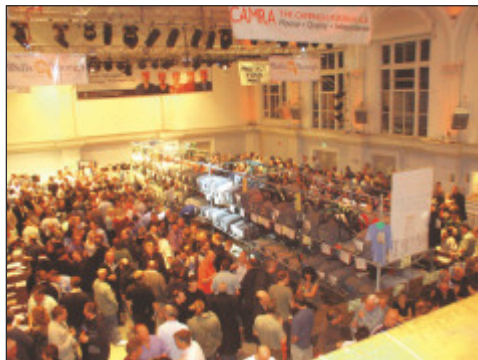
A busy evening session at the bars

As most local people now know, Young's of Wandsworth in London joined Charles Wells to form a new brewing company at the beginning of October. Although the two parent companies are maintaining their separate pub estates, beers for both are now brewed at the Wells plant in Queen's Park, Bedford.