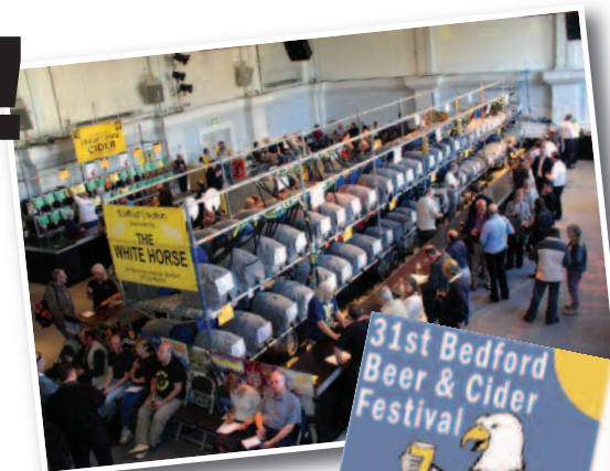
Logo by Suni UK Ltd www.suniscreen.co.uk