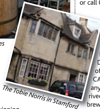
The Tobie Norris in Stamford

After two micro-breweries and four or five pubs already, our hungry and thirsty party finished the day with a booked evening meal at the Goat at Frognall, near Deeping St James. A cosy, comfortable pub offering Hopshackle beers among many others, real draught cider and – for those who can't get enough – more than 50 single malt whiskies. The food was excellent and we left in a happy mood, if somewhat tired. Details of the Goat, the White Hart, the Tobie Norris and the two breweries can also be found in the new Good Beer Guide 2009.