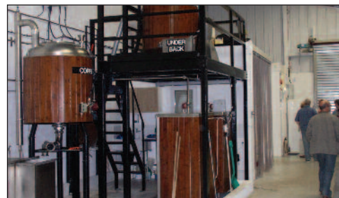
Inside Hopshackle Brewery

Hopshackle has no pubs of its own but supplies direct to more than 40 outlets. For further details, call Nigel on 01778 348542 or visit www.hopshacklebrewery.co.uk