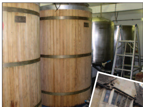
Brewing plant at Ufford Ales

CAMRA members do not just work hard organising beer festivals and surveying pubs for guides – we also have fun. Last June a coachload took the A1 up to Stamford for a day, managing to visit two micro-breweries and a whole bevy of pubs before falling asleep on the coach home.