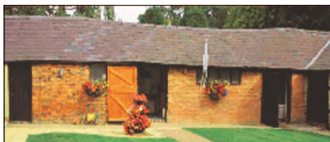
The brewery, housed in former stables