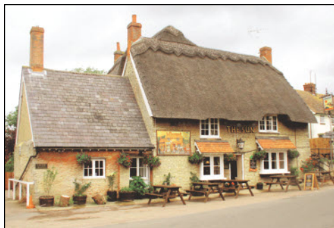
A new look to the Sun, Felmersham

Welcome to Sue and Bill, who took over this pretty, thatched village pub in March. The interior has been spruced up and opens all day, with bar meals now available from 12 to 3 and 5 to 9pm, including a daily special and a roast on Sunday. A restaurant service may start later. Wells Eagle IPA is available on handpump, with a changing guest beer likely to join it soon. A convenient stop for visits to the nearby riverside nature reserve. Call 01234 781355.