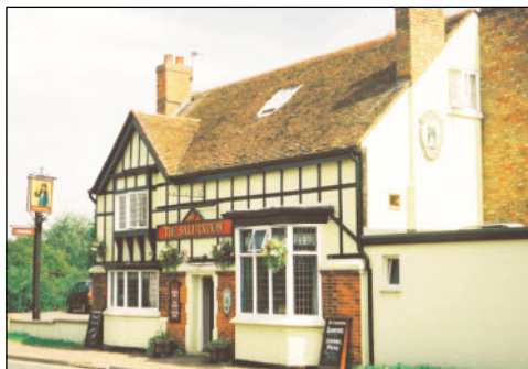
Five real ales at the Salutation, Blunham

After months boarded up and looking ripe for demolition, the Queen has been refurbished and re-opened as a community pub by a private owner, with much enthusiasm from the locals. The bar is open all day from 12 noon and currently offers Young's Bitter on handpump, although licensee Meena Banhard may add a guest beer in due course. Regular live music and occasional summer barbecues are planned. Congratulations to Queen's Park for getting back its only local!