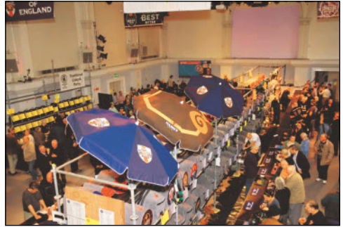
Scene from last year's Bedford festival

Local CAMRA members have run a festival in Bedford every autumn since 1978. All except one has been held in the Corn Exchange – the event had to migrate to Queen's Park in 1988 while its usual home was closed for extensive renovation.