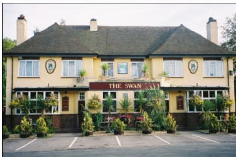
Thai food served at the Swan, Cranfield