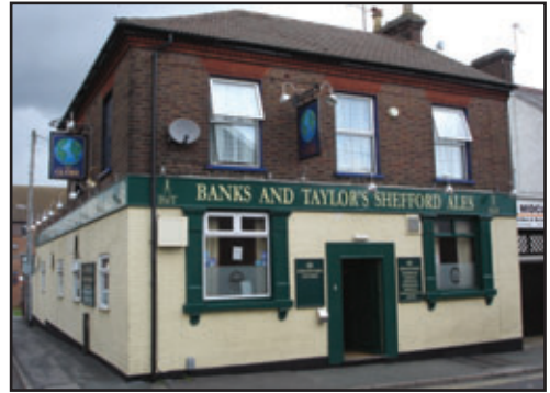
The Globe, Dunstable – Beds POTY 2009

been South Beds branch Pub of the Year for three successive years and has earned its accolade as CAMRA's best pub in Bedfordshire for 2009.