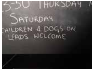
Royal Oak, Carlton

was a very busy quiz night, and clearly attracted custom coming out from Rushden. Though not a cask-ale specialist house, it offers GK IPA and Abbot. The welcome was friendly and the atmosphere light-hearted.