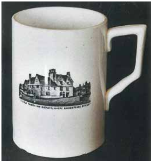
A Victorian quart mug commemorating Shakespeare's stay in Bidford

From this spot eight surrounding villages were visible as listed in the following lines written by Shakespeare: 'Piping Pebworth, dancing Marston, haunted Hillbro, hungry Grafton, dodging Exhall, papist Wixford, beggarly Broom and drunken Bidford'.