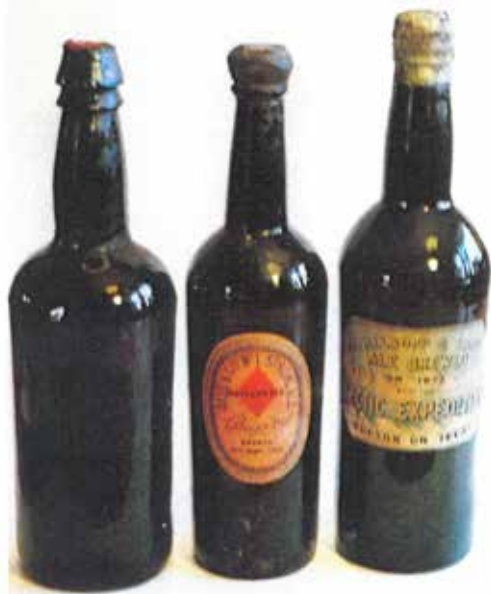
Left to right: A beer commemorating the Battle of the Nile (1798); Ratcliff Ale (1869); Arctic Ale brewed for the expedition of 1875