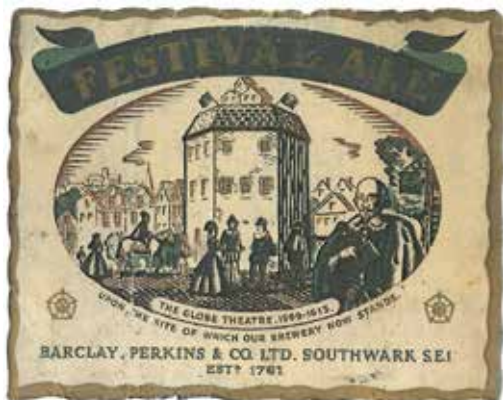
Festival Ale brewed by Barclay Perkins for the Festival of Britain (1951)

Seven of these are noted in my road map (four miles to the inch) of Great Britain from which a good guess can be made of the location of the crab-apple tree. The lines and a picture of the Falcon Inn at Bidford are featured on a Victorian quart mug which I acquired some years ago.