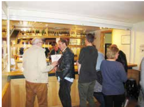
International Beer Bar