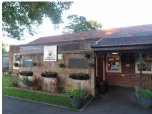
Cranfield University Social Club

The itinerary for North Beds CAMRA's May trip included two clubs we hadn't visited before. So a novel experience for most of us. But at the Red Lion at Salford , nothing much had changed since our last visit. Only Wells Eagle was on handpump. So after one swift half we moved quickly on to the Swan in Salford , a dining pub. On handpump they had Greene King IPA and Hook Norton's Hooky Bitter (3.5% abv), which was in good condition.