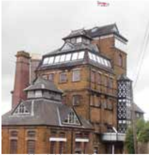
Hook Norton Brewery

Moving on from this small but eccentric brewery, we arrived next at a much larger, much older, and highly traditional brewery – Hook Norton. I'd never visited it before, and I wasn't