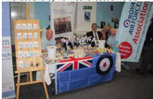
The RAFA Club stall raised for a great amount for charity, and they also ran the cloakroom

THANK YOU TO EACH AND EVERY VOLUNTEER – without you the festival could not have happened – you are all amazing.